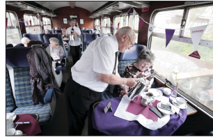
Enjoying an afternoon tea