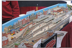
Model Railway weekend